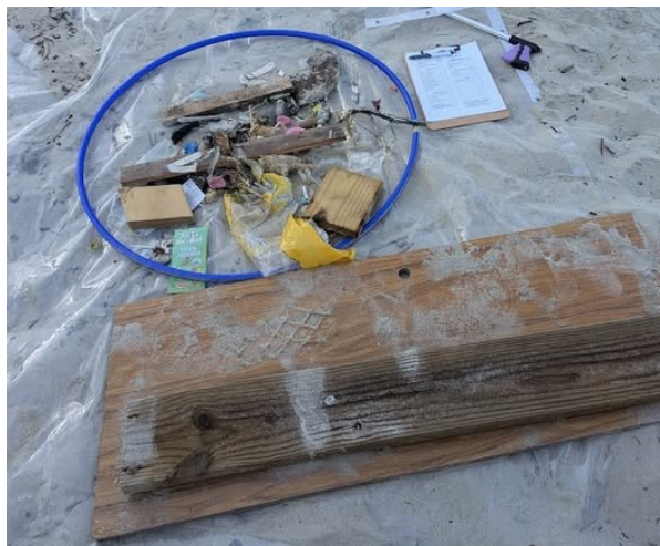
Trash collected by River Road Animal Hospital staff at last week's Flash Sweep

I promise I will: Keep off dunes and plants Pick up trash Fill all holes Keep glass off the beach Protect sea turtles Remove all gear from the Beach by 8:30pm each day